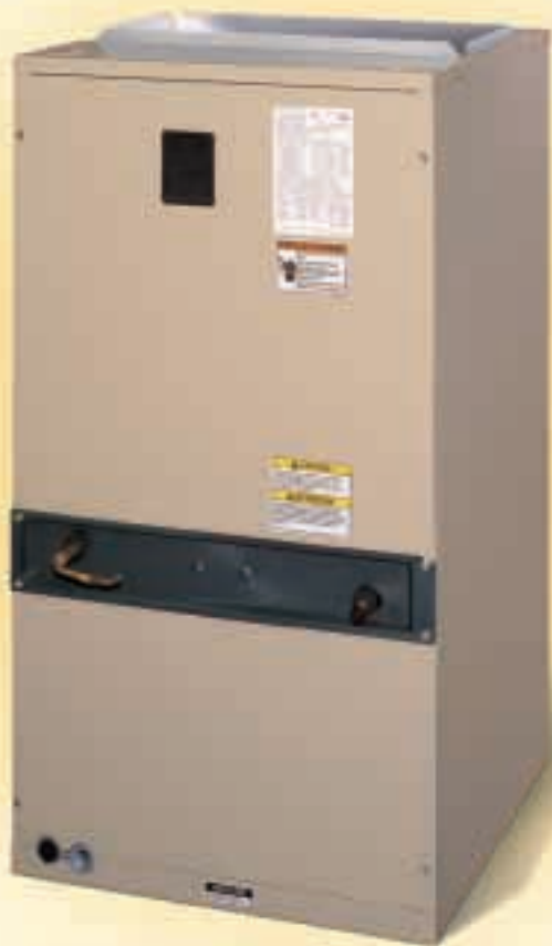
F*RP, FP—Heat Pump and AC Models F*RC, FC—AC Only Models F*FV—ECM Models

Quiet operation and flexibility are key benefits of our Air Handlers.