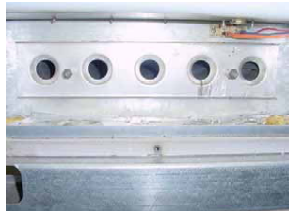
FIGURE 1: Shoot Thru Plate Before Removal