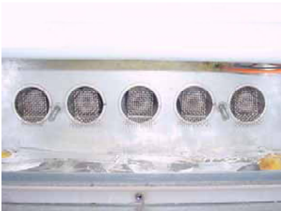
FIGURE 3: Screen Inserted in Heat Exchanger Tube