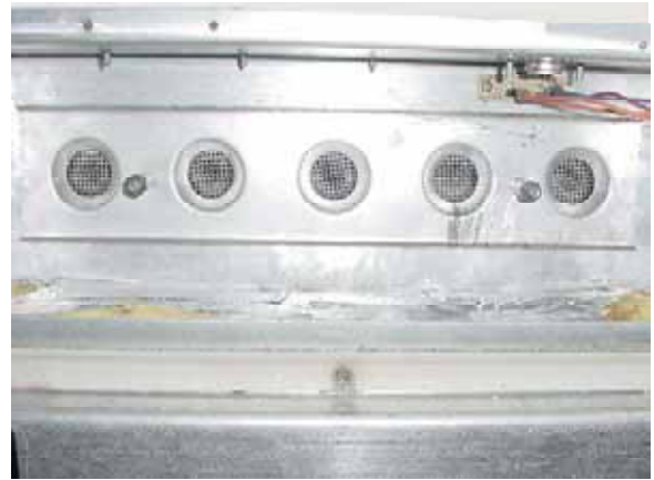
FIGURE 4: Shoot Thru Plate Reinstall