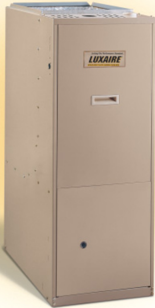
Model G9D Shown

These deluxe gas-fired furnaces provide a unique combination of energy savings, plus they operate at lower sound levels than conventional furnaces and provide levels of comfort unmatched by single-stage models.